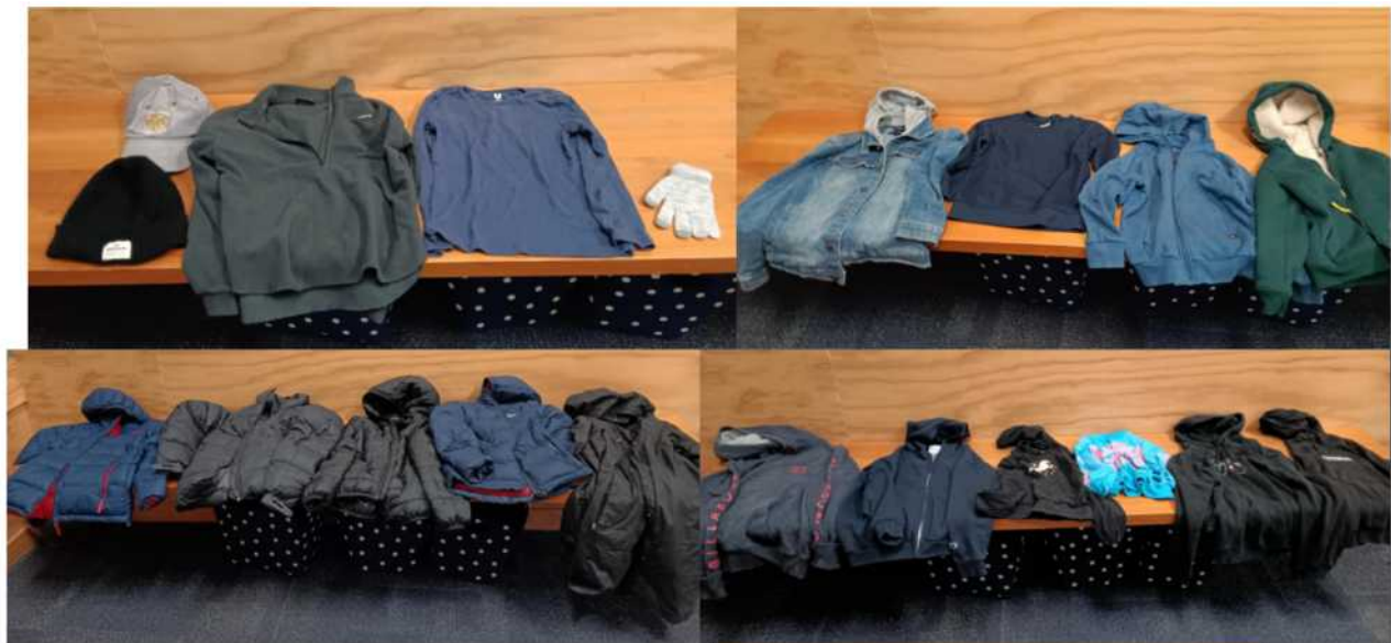
The coats are L-R Blue Mac Pac size 10 Black Macpac size 10 Black H&M Size 8-10 Blue Kathmandu size 10 Black Kiwistuff raincoat - adult size