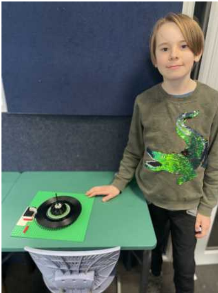
I have created a (mostly) functional record player completely out of LEGO! It uses a pin shoved into a hinge piece as the head and is held down via a large Wheel? It is then spun using the axel coming out of it. Nolan